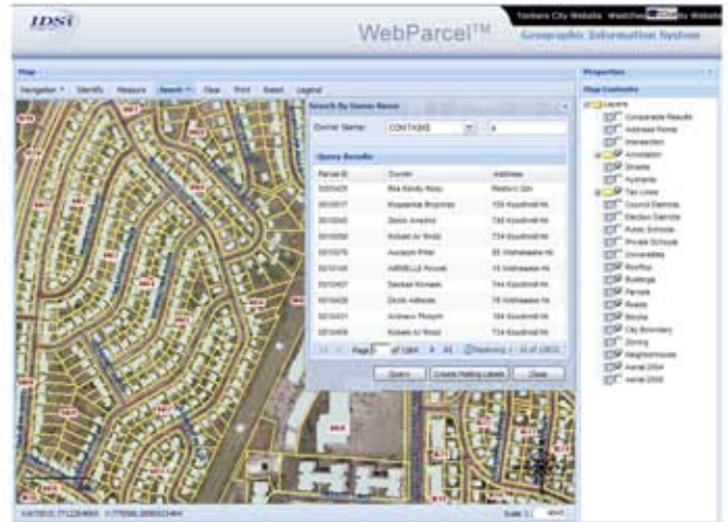
Search and locate a parcel and view the associated tax assessor's database in a single view

This product is an important tool for a local government agency moving towards complete task automation, e-Governance and strengthening relations with the community by reaching out to citizens with updated information and proactive planning tools. The WebParcel™ can be customized to implement different security levels and functionalities specific to various departments such as Public Works, Planning, and Emergency Response and can be integrated with third party systems